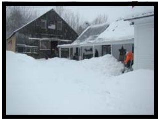
Our house and barn under all the snow