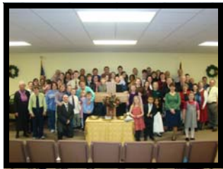
Church family January 2008.